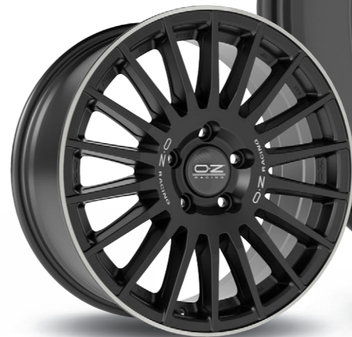
Matt Black Diamond Lip