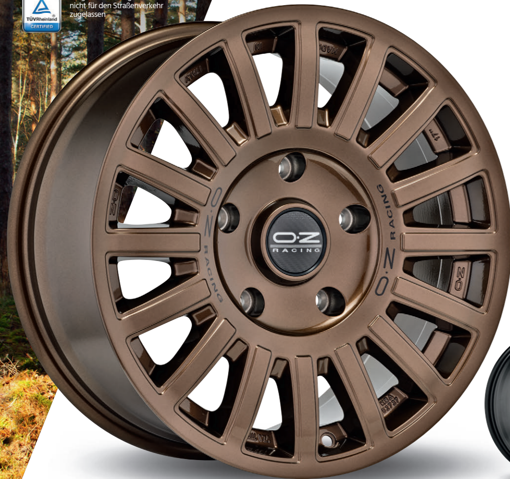
Gloss Bronze + Black Lettering

Einige Anwendungen sind nicht für den Straßenverkehr zugelassen