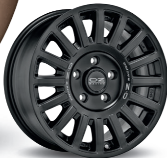
Matt Black + Silver Lettering