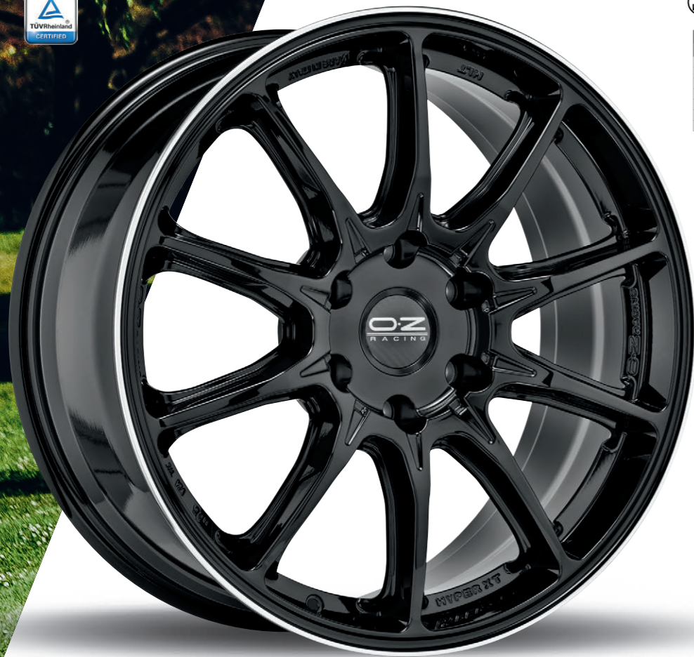
Gloss Black Diamond Lip