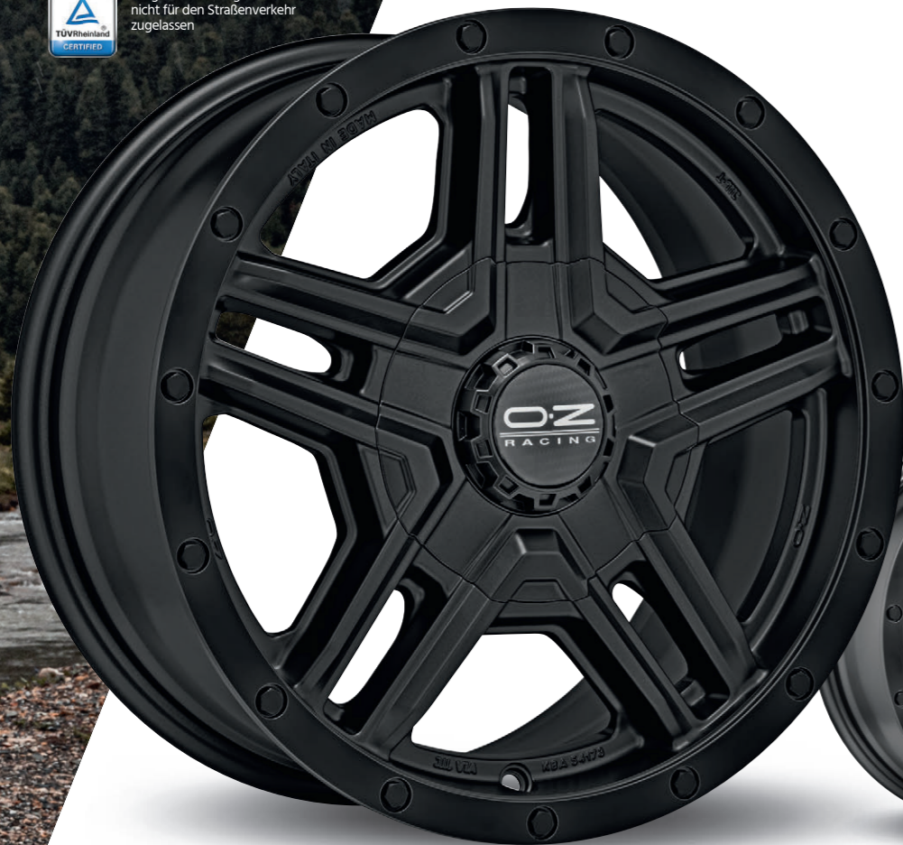
Matt Black + Rivets

Einige Anwendungen sind nicht für den Straßenverkehr zugelassen