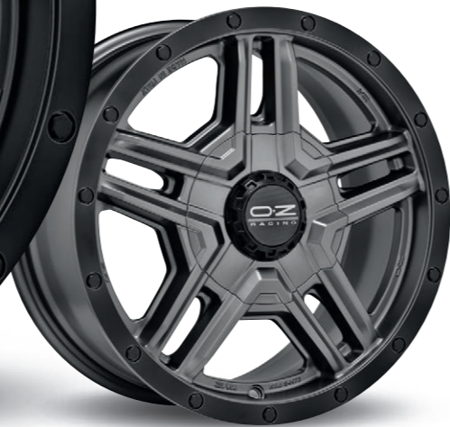
Matt Dark Graphite Black Lip + Rivets